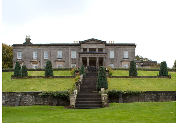
Aberlour House, exterior

Emotional abuse was inherent in both the sexual and the physical abuse. It could occasionally be seen in the humiliation of children by a few teachers, as well as the response of some children to the spartan and