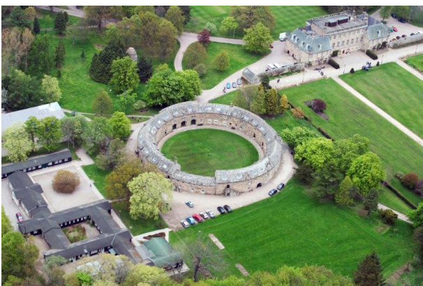
Aerial view of the Round Square boarding house

The ethos is based on four pillars: challenge, responsibility, service and internationalism. The school aims to encourage learning through experience and all students participate in a continuous programme of outdoor education. Each pupil undertakes at least one form of community service and there are various opportunities for students to participate in international links ... The wide range of activities offer opportunities for students to develop confidence, resilience, motivation, team working and leadership skills and an awareness of the needs of others both at home and abroad. 236