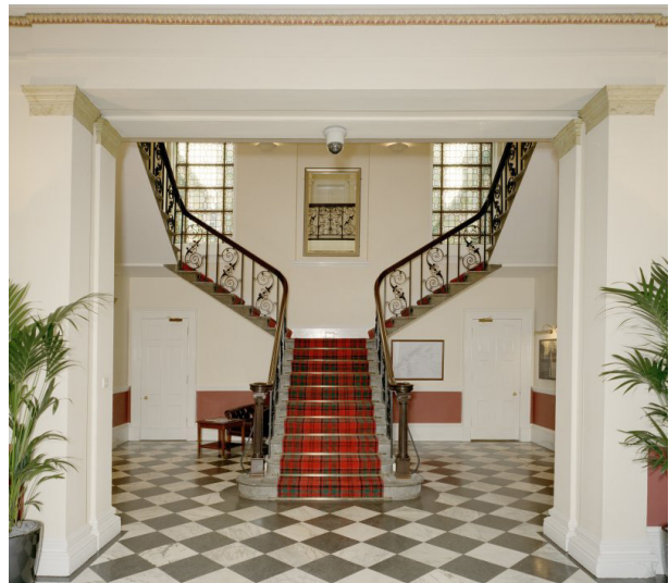
Aberlour House, interior

Little changed over time, it appears. Even as late as 1990 the windows still never shut properly. 154 In fairness to Toby Coghill, when he was appointed as the new headmaster in 1964 he recognised that there was 'considerable modernisation to be done both to the buildings and to the teaching programmes'. 155 Nevertheless, the spartan ethos remained fundamentally the same.